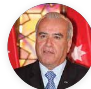
Prof. Walid Maani, former minister of education, and minister of higher education and scientific research.